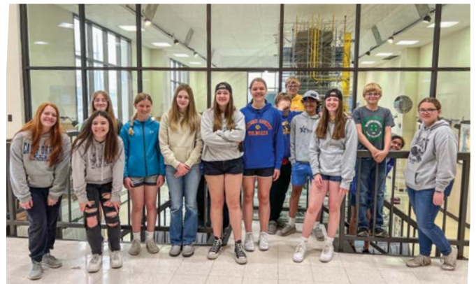
Eighteen seventh- and eighth-graders from Maddock Public School took advantage of NPEC's power plant tour program in May.