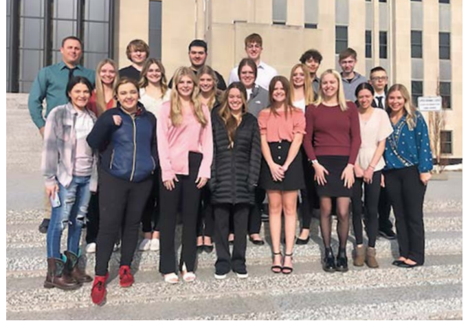
Harvey High School brought 20 seniors in February to view the Legislature in action as part of the Northern Plains Electric Cooperative legislative tour program.