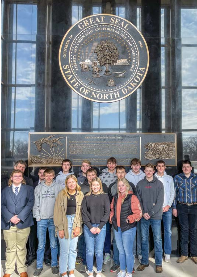
A group of 19 junior and senior students from Fessenden-Bowdon High School visit the legislative session on March 15, partially sponsored by Northern Plains Electric Cooperative.