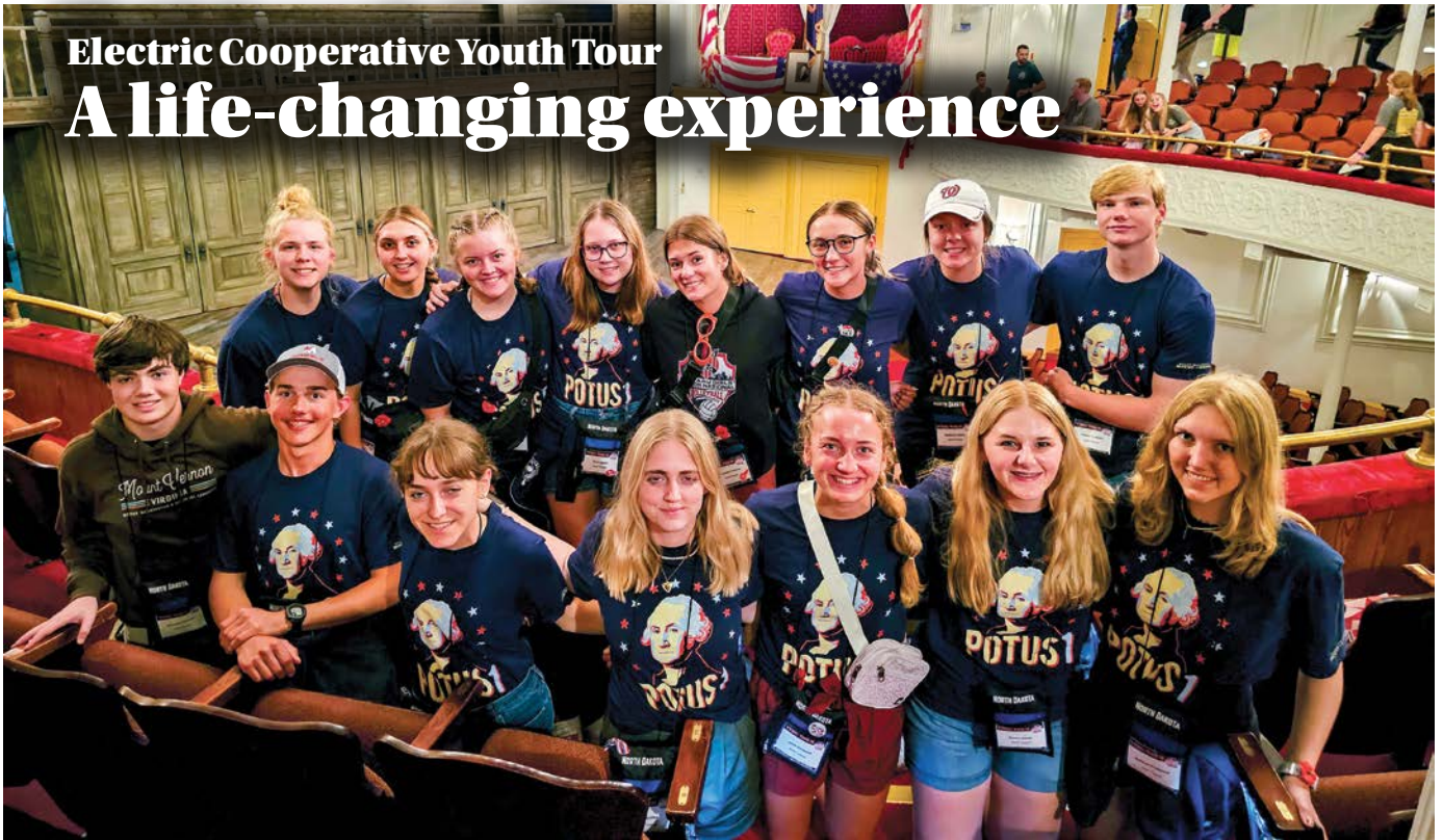
The North Dakota students visited many memorials, including Ford's Theatre. The theater is infamous for being the site of the assassination of Abraham Lincoln.

For over 50 years, teens from rural America have been coming to Washington, D.C., on the “trip of a lifetime,” the Electric Cooperative Youth Tour, courtesy of their local sponsoring electric cooperative.