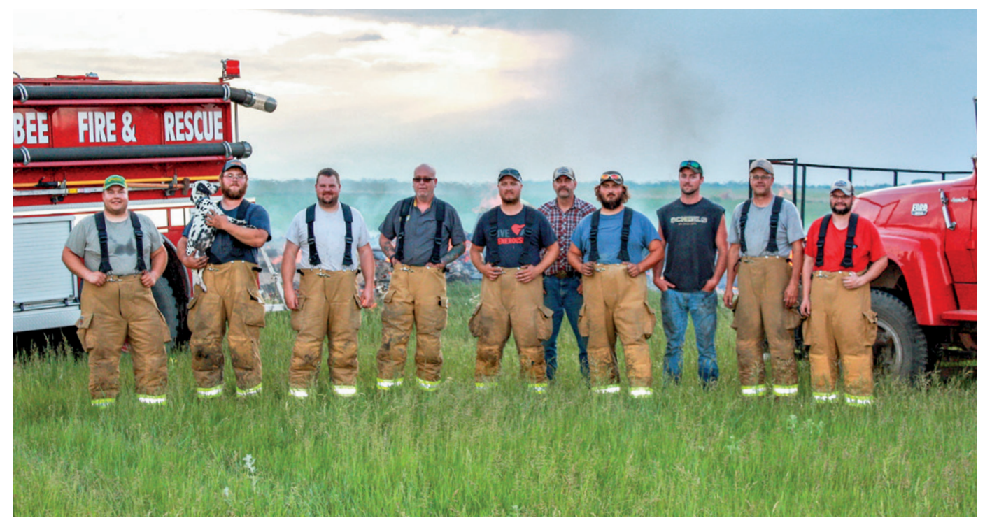
The Bisbee Rural Fire District received $7,500 toward the purchase of a Polaris Ranger equipped with firefighting apparatus to attack wildland grass fires.