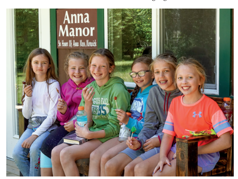
The Metigoshe Ministries received $5,000 toward construction to expand its facilities due to an increased number of summer campers and an increasing demand for accommodations and conference spaces.

Congratulations to these deserving organizations! ■